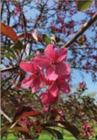
Malus 'Royal Raindrops'