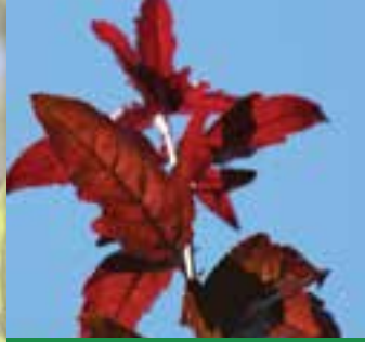
Malus 'Royal Raindrops'