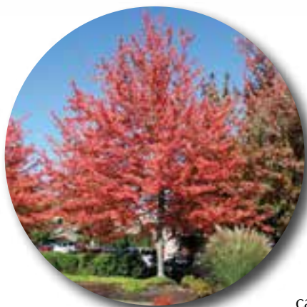
Acer rubrum Red Sunset ®

Ruppert Nurseries grows five varieties of Red Maples. These trees make great street trees and are very adaptable to a variety of site conditions. The fall colors range from orange-red to deep red. Colors occur at different times and last for varying rates.