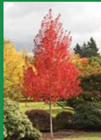
Acer rubrum Red Pointe ®

Acer x freemanii 'Armstrong' grows quickly and is a great street tree. It is a narrow tree so it lends itself well where space is limited. Again, the fall color is fantastic yellow to orange-red. Armstrong can also be used as an allee or a tall hedge.