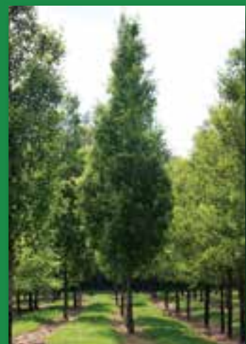
Acer x freemanii 'Armstrong'