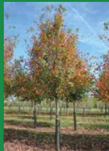
Acer rubrum 'Sun Valley'

Acer rubrum Red Pointe ® is heat resistant, fast growing and has consistent red fall color. It has well-behaved, easily maintained, balanced growth and requires very little pruning and shaping to develop a symmetrical canopy.