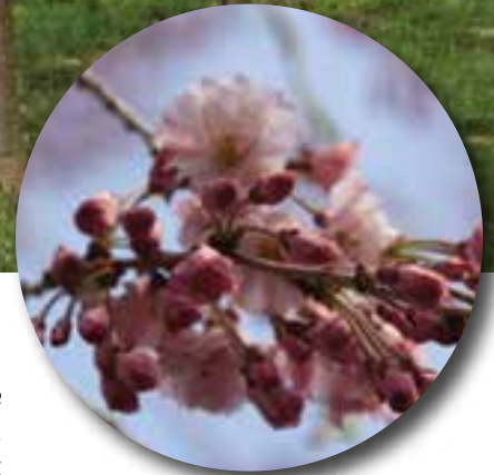
Prunus subhirtella 'Pendula'

Prunus serrulata 'Kwanzan' is arguably the showiest of all spring blooming cherries. The Kwanzan Cherry has fluffy, double pink blossoms and typically is one of the last to bloom. It has a distinct upright vase shape and is a good choice to line a driveway or to plant in a group.