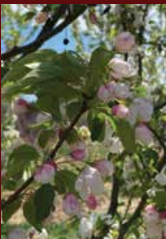
Malus 'Donald Wyman'