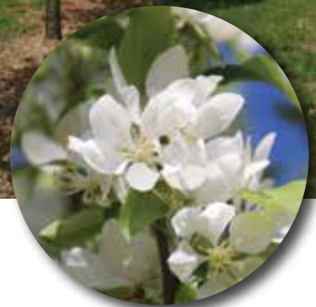
Malus 'Spring Snow'