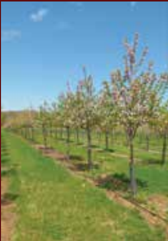
Malus 'Donald Wyman'