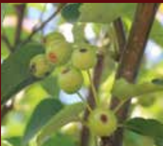
Malus 'Donald Wyman'